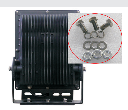
Steel Plate Mounting

Wall Mounting: At the setting area, bore a hole according to Base Drawing with a 6mm diameter drill, and put Anchor Bolt of M6 in the hole of the wall, and then fix the arm with screw nut.